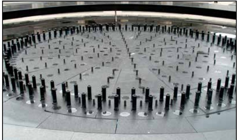
Product: Fibergrate® Covered Molded Grating Application: Lincoln Center Fountain