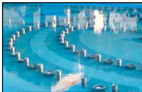
Application: Fair Park Fountain Product: Fibergrate Molded Grating