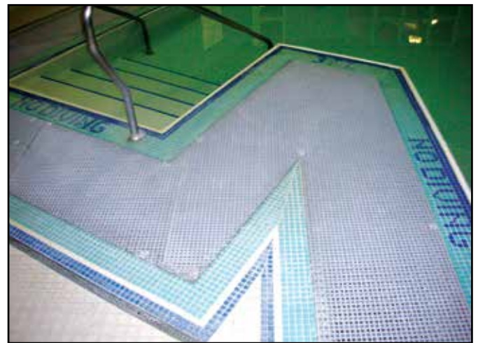
Application: Public Pool Drainage Covers Product: Micro-Mesh Molded Grating