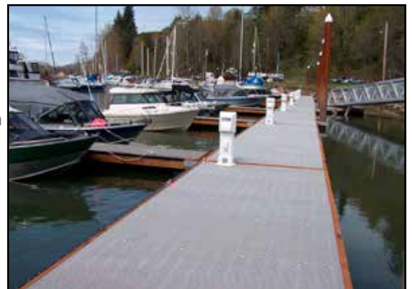
Application: Marina Decking Product: Safe-T-Span Pultruded Grating