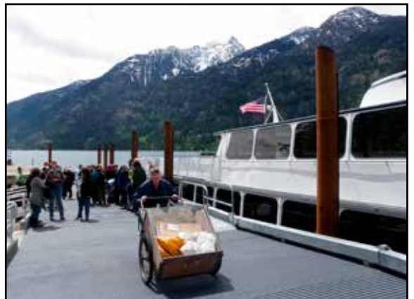
Application: Ferry Boat Access Product: Safe-T-Span Pultruded Grating