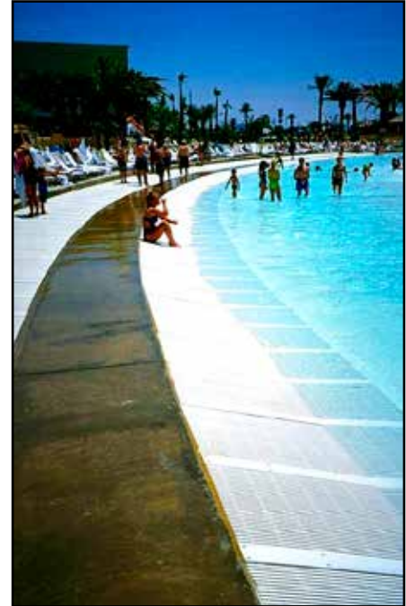
Application: Wave Pool Drainage Product: Aquagrate® Pultruded Grating