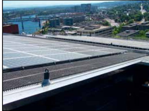
Application: Rooftop Solar Panel Walkway Product: Fibergrate® Molded Grating