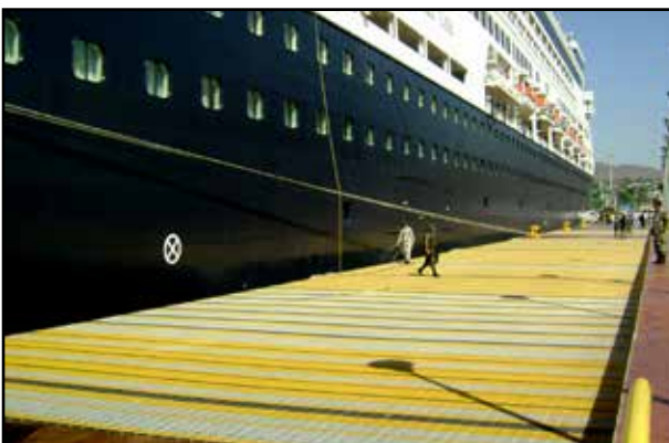
Application: Cruise Ship Terminal Product: Safe-T-Span Pultruded Grating