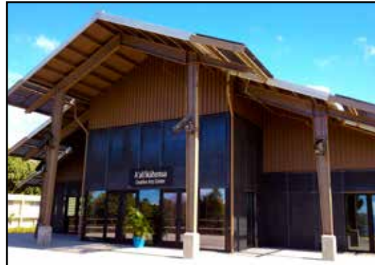
Application: Screening/Sunscreens Product: Safe-T-Span® Pultruded Grating