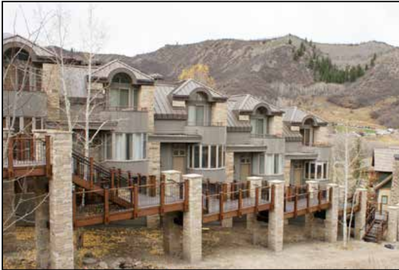
Application: Walkways and Stairs Product: Safe-T-Span® Pultruded Grating