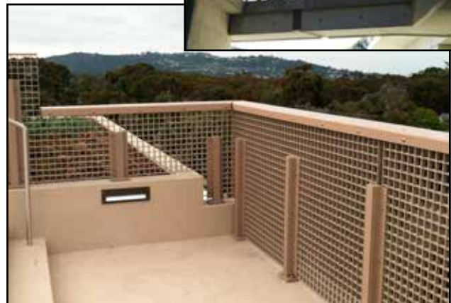
Application: Fencing and Railings Product: Fibergrate Molded Grating