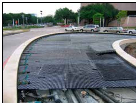
Application: Galleria Fountain Product: Fibergrate Molded Grating