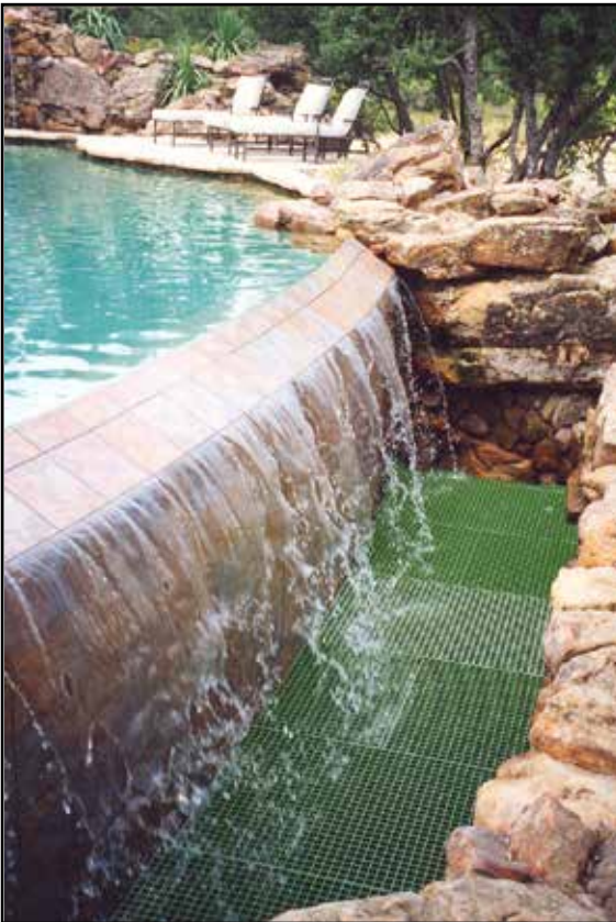
Application: Resort Pool - Overflow Drainage Covers Product: Fibergrate® Molded Grating